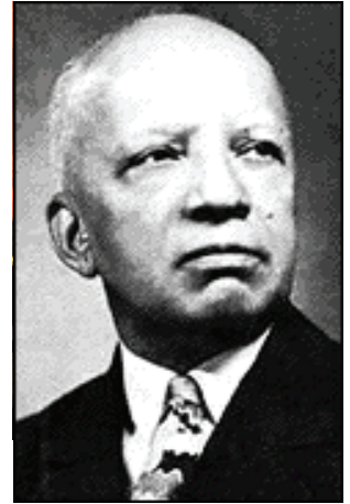
Dr. Carter G. Woodson

After establishing “Negro History Week” it soon evolved into Black History Month. Dr. Woodson’s efforts are appreciated and celebrated worldwide, for this we thank him for his ongoing struggle to bring diversity into the history books.