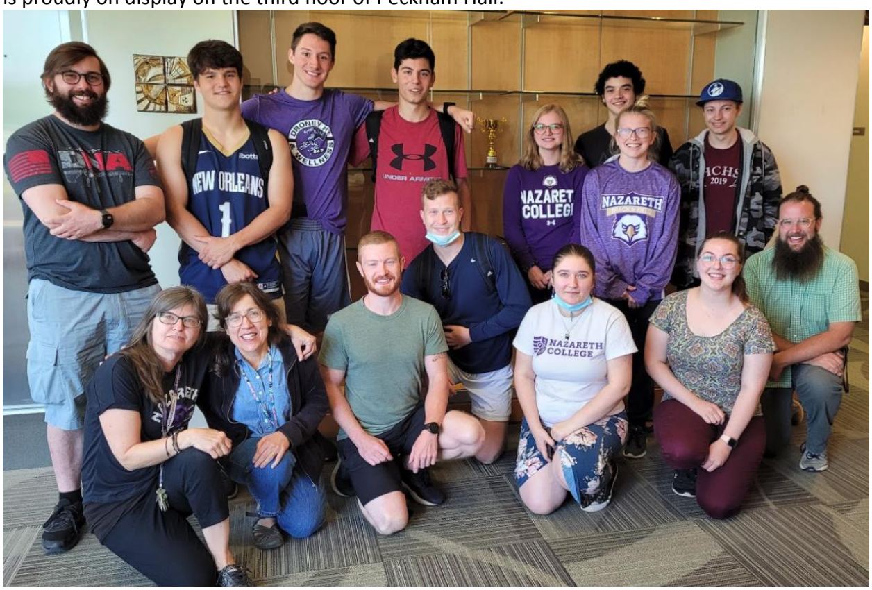
Look at this great group of awesome scientists!

Did we mention Chemistry won the Inaugural Summer Research Games? The AMAZING trophy is proudly on display on the third floor of Peckham Hall.