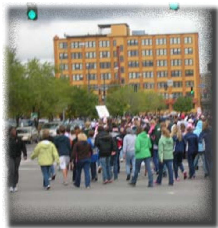
Making Strides Breast Cancer Walk 2010 - Rochester, NY